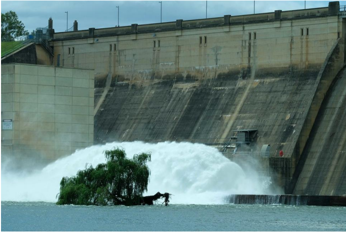
Above: Hume Dam outflow;