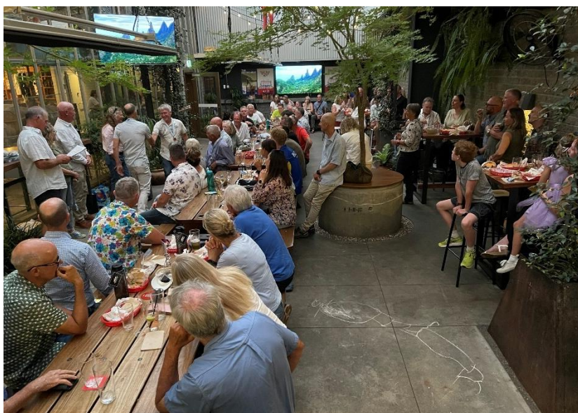
Above: paddlers and friends enjoying their dinner at the Canberra Brewery while medals were awarded for the Friday and Saturday races.