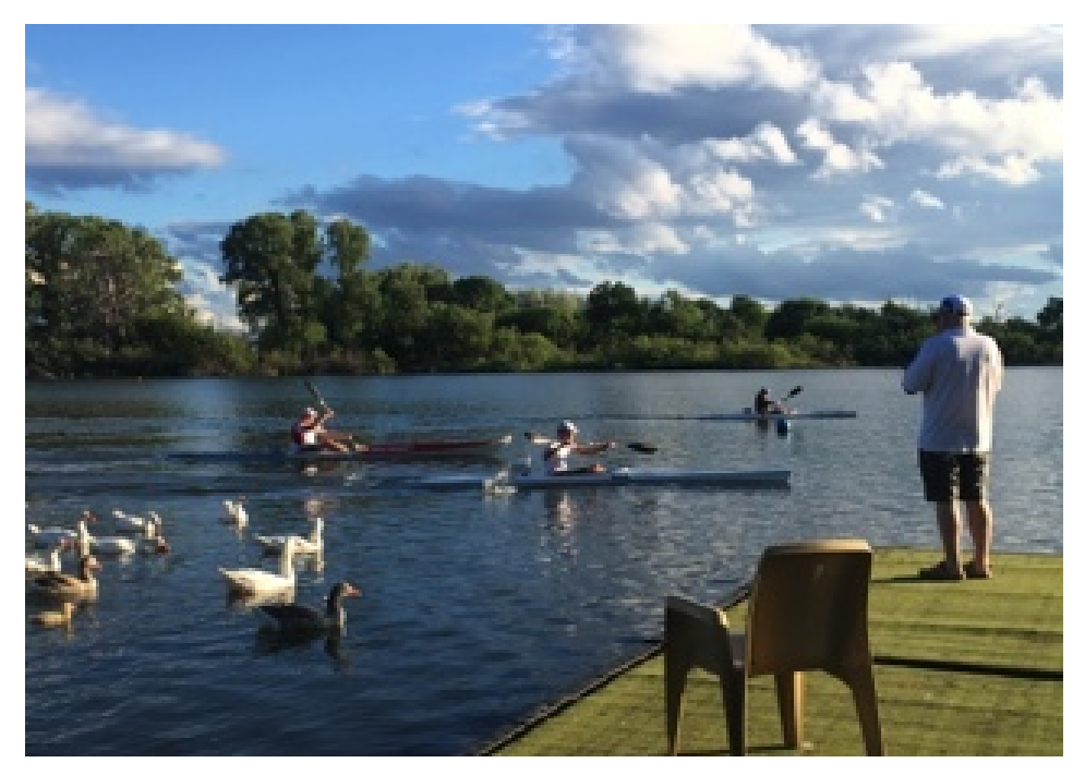
Entertaining the geese

Wetspot Summer Series 2018–19 Series Calendar