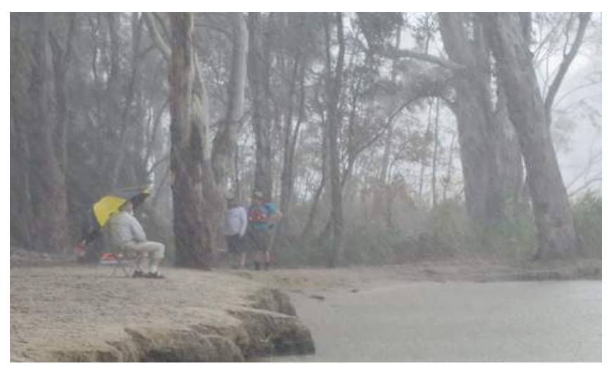
The loneliness of the long distance land crew! David Tongway waits patiently in the rain at the end of day 3.