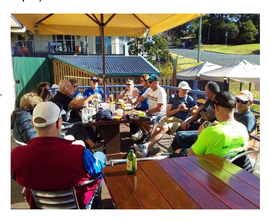
Refuelling and sunbathing after the Nelligen Challenge

The club's 3 race Nelligen Challenge is scheduled for Sunday 11<sup>th</sup> August, and 8<sup>th</sup> and 22<sup>nd</sup> September. Details on the website with more to be sent out closer to the time. Nelligen's temps are often 5 degrees higher, the water warmer and clear. There's a handy café for postrace food and race wrap up, and it's less than 2 hours away.