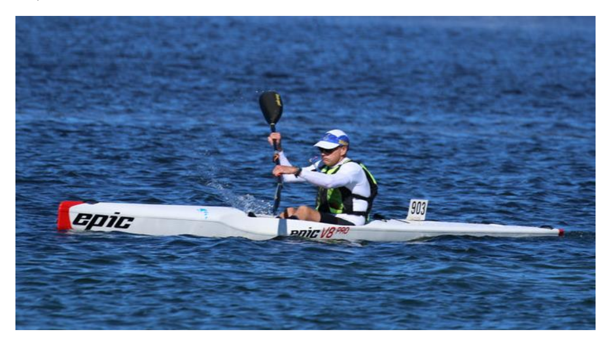
And showing nice form at Davistown.

Ed: Huge thanks from all of us Russell, you've done a mighty job and are leaving the ship in very good shape!