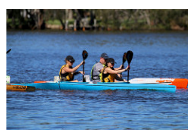
BGCC paddlers' race results, race 3, Tacoma