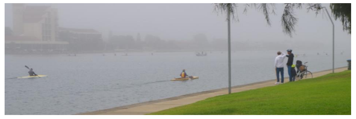
Ian Castell-Brown and Allan Newhouse about to disappear into the fog on the first lap early on Saturday morning.